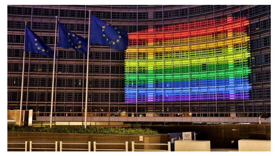
Figure 6 The building of the European Commission lit up with the Rainbow flag, supporting the LGBTQ community.

In several European countries, hashtags such as #homophobia, #May 17 and #IDAHOTB were trending on Sunday.