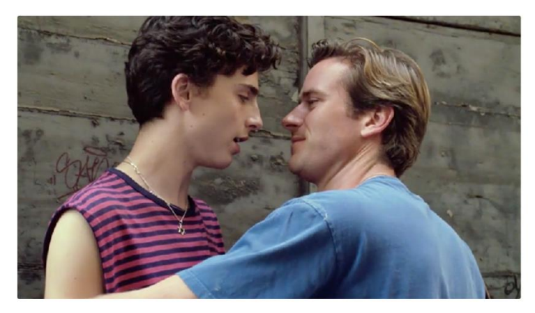
Figure 11 Photo from the film, the tension and attraction are gradually building up

They both use their sexuality as a means of self-expression while trying to get each other's attention. Elio is sexually involved with her friend Marzia while Oliver openly flirts with Chiara. While this film tells the story of a homosexual romance, it isn't explicitly a homosexual movie. The two protagonists "could more accurately be described as bisexual or pansexual, attracted to men and women alike"<sup>38</sup>. Therefore, this film does not explicitly refer to the LGBTQ+ community and it portrays a