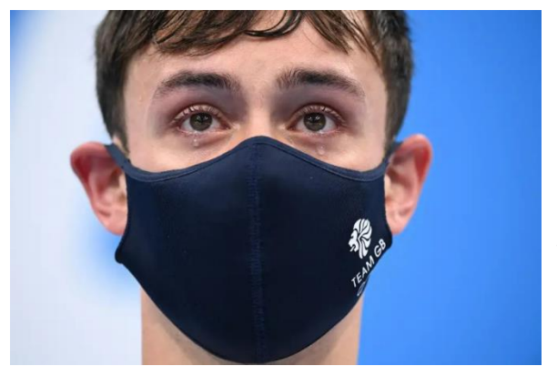
Figure 1 Figure 1 An image of an emotional Daley on the Olympic podium after he had received the gold medal.

"Lots of people would come out after they had retired, so I just hope that winning an Olympic gold medal, winning any Olympic medal, going to the Olympics as a gay person, a member of the LGBT community, that any young kids out there that feel like they are less than... who feel like they are on the outside and feel different, or feel like they're never going to achieve anything just because of who they are... they know that with hard work, you can achieve anything.