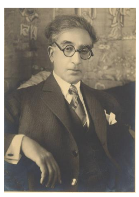
Figure 12 Cavafy in his 50s.