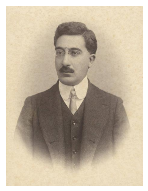
Figure 13 Cavafy at a young age.